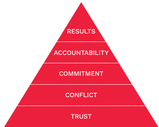
The Five Behaviors Model

The experience is completed through a half-day training session, led by a trained Five Behaviors expert. This session includes a walkthrough of the Personal Development profile, breakout activities, and group discussion.